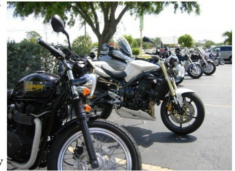
First Meeting's Turnout

1. Rides - It's time to setup a ride...after all, that's why were doing this, right? Aside from us all itchin' to get out and burn some fuel together, we need to setup up 3 separate rides for the year to submit to Triumph for approval. With this, we will become a chartered RAT club and be fully recognized by Tri-