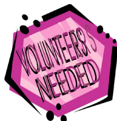
Volunteers are needed and appreciated!

Such bad images pop up when that phrase it uttered, but that just isn't the case when it comes to our R.A.T. Pack. We're looking for people to help out with the Newsletter, keeping track of membership, and funds.