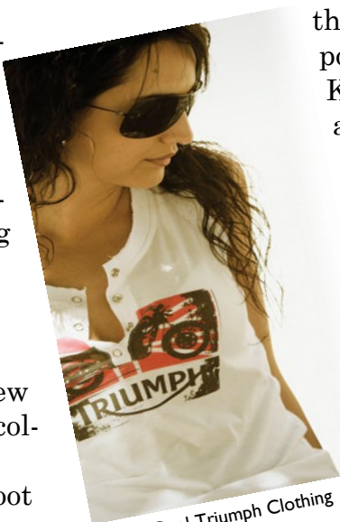
Cool Triumph Clothing

Helmets, shirts (excluding the new Steve McQueen collectible,) jackets, sissy bars, and foot pegs, OH MY!