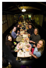
Getting together with friends is what it's about!

Mark your calendars. 7pm Thursday, May 15th either at Miller's Ale House located at the Gulf Coast Town Center off Alico Road and Ben Hill Griffin Parkway or the North Naples Country Club at 10095 Tami-ami Trail North. We figure that we can try out a few differ-