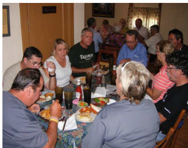
A mixture of Hap's Rats and Gulf Coast Rats

stopped to put on some rain gear just before Immokalee. Good thing we did, because just south of there, we got hit by several very hard down-