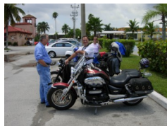
Peeling out of rain-gear

We lunched and dried out at the Seafood Depot. Back in the parking lot, we were contemplating whether or not to don our rain gear when the choice was made for us. Riding north in the rain, we decided to jump on I-75 for the return trip.